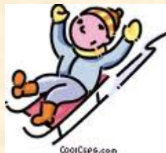
Tanja: Coasting down the hill.