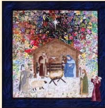
Vesna Germanski Prosalava na Bozik.