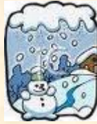
Francsuki: paga sneg

Child 1: Hey guys. Come here. Let's show mom that winter is great.